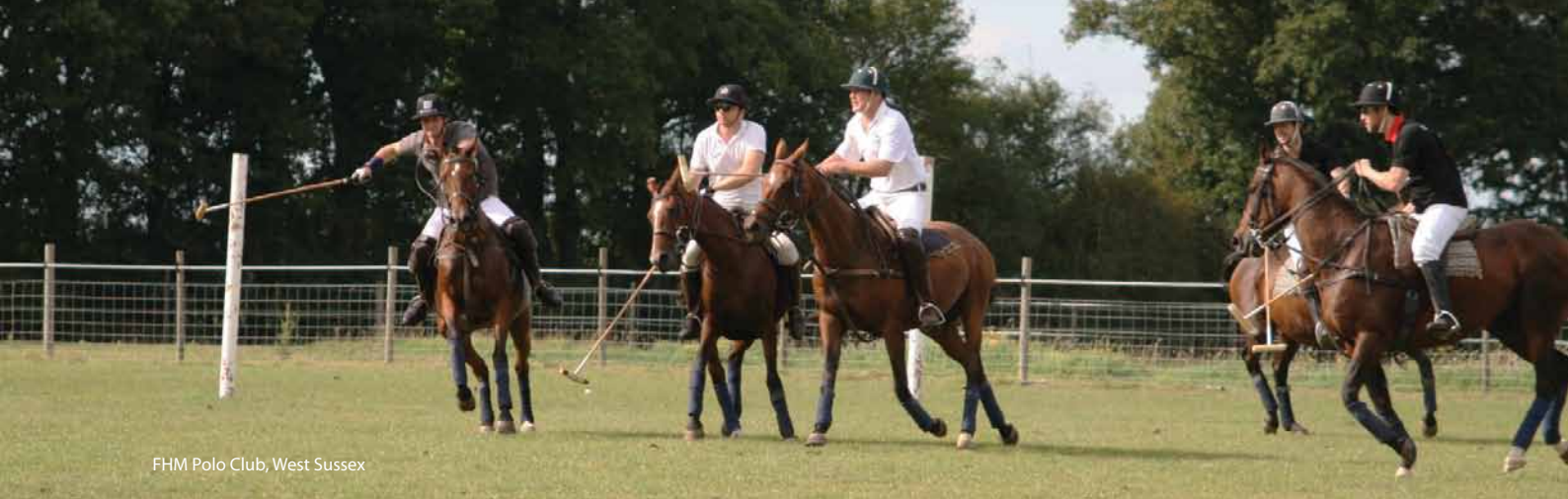
FHM Polo Club, West Sussex