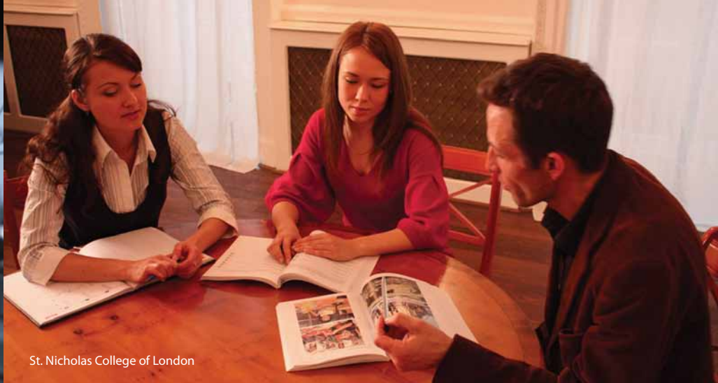
St. Nicholas College of London