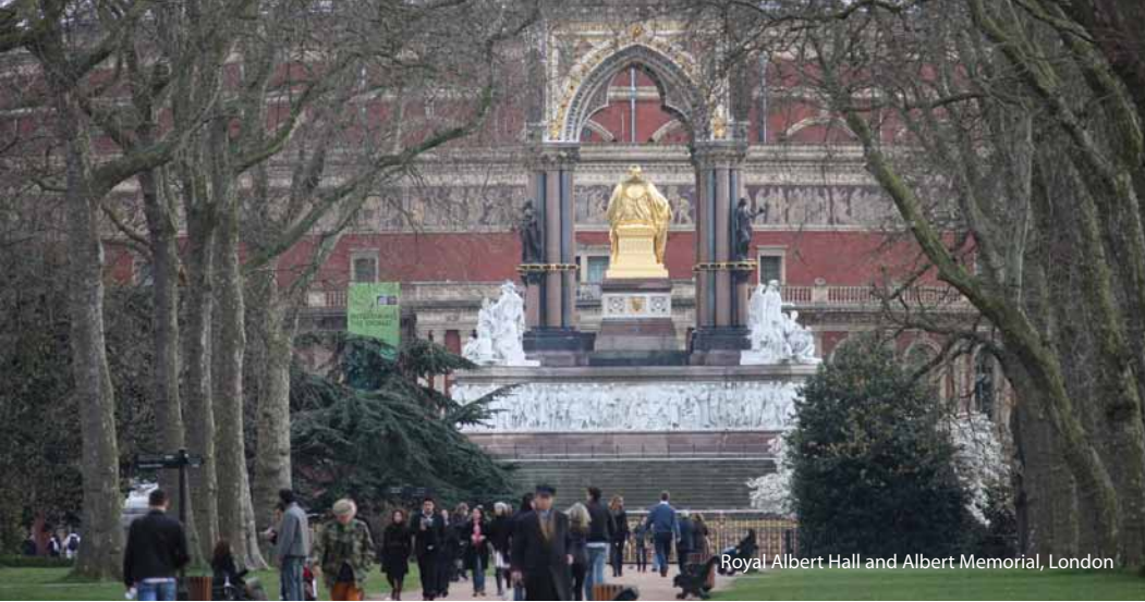
Royal Albert Hall and Albert Memorial, London