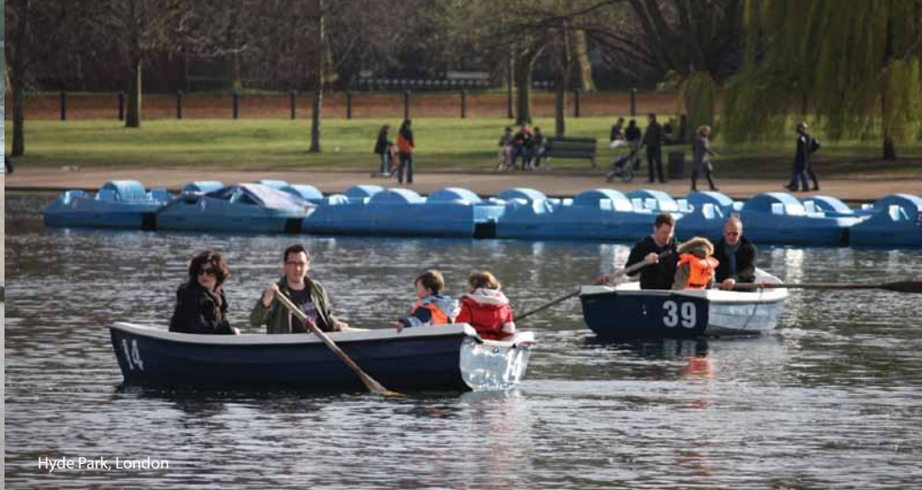
Hyde Park, London