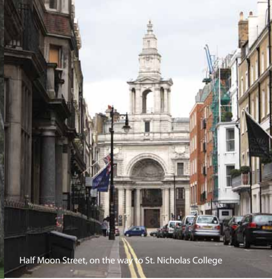
Half Moon Street, on the way to St. Nicholas College